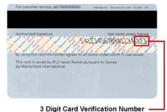
3 Digit Card Verification Number

All orders / postal address: (Please allow 5-7 days for processing and delivery)